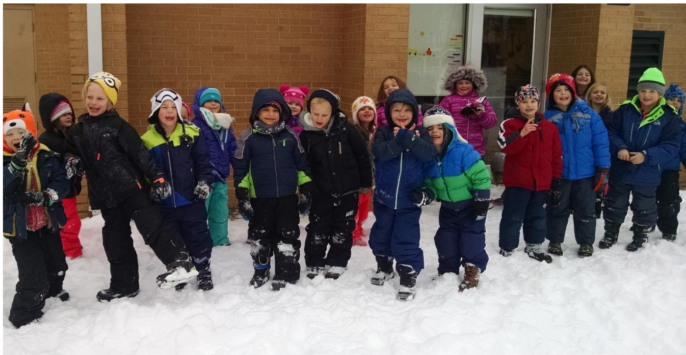
Kindergarten students enjoy the first big snow!