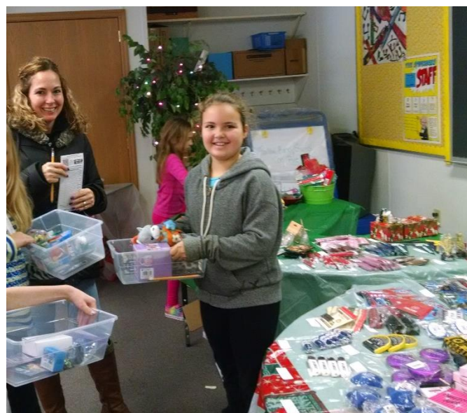
Santa shop was a big hit! Thank you to all our volunteer elfs!